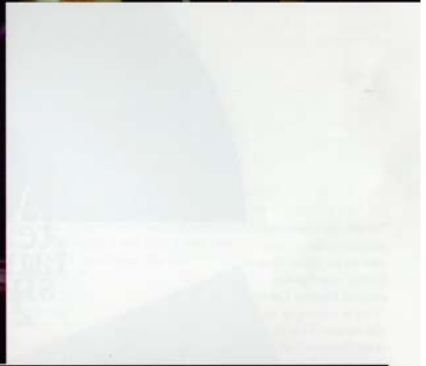
The Lido's first tableau, "C'est Magique" (this page, above), starts with a bit of theatrical magic as the dance floor in the center of the dining room becomes the raised thrust stage. Later, a merry-go-round device designed by Yves Valente carries the female performers off the stage and over the audience. Bob Rang designed the "Casino" tableau (this page, top right), which becomes a nightmare sequence. Lasers and smoke come out of the craps table, which turns into a joker with an inflatable tongue, who descends on an elevator, laughing at the hapless players. Every Lido de Paris show features a water tableau; in "Illusion" (this page, right), the sets and lead performers' costumes are "made of water," according to Valente. Sprays form walls and columns as well as radiate from the women like ostrich plumes as they pose on the staircase.